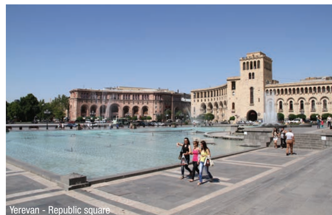
Yerevan - Republic square