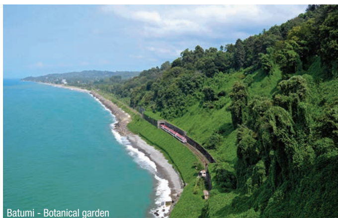
Batumi - Botanical garden