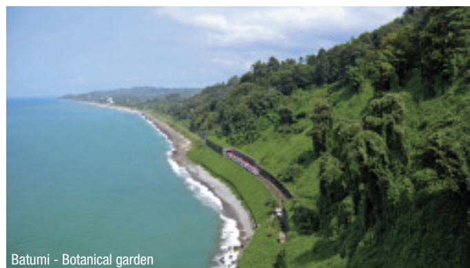
Batumi - Botanical garden