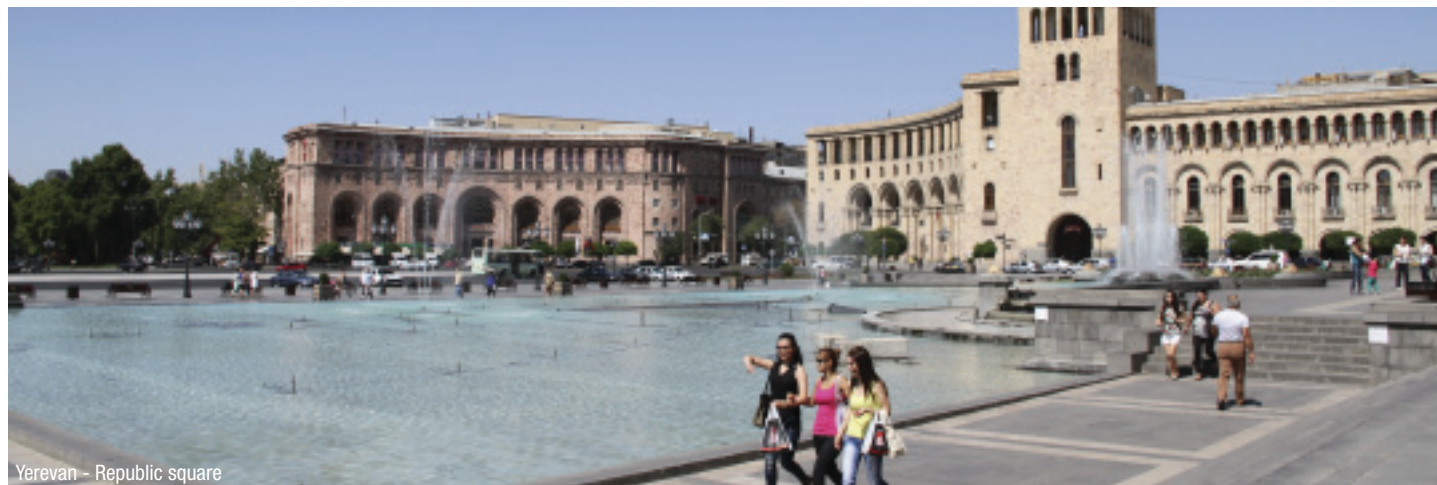
Yerevan - Republic square